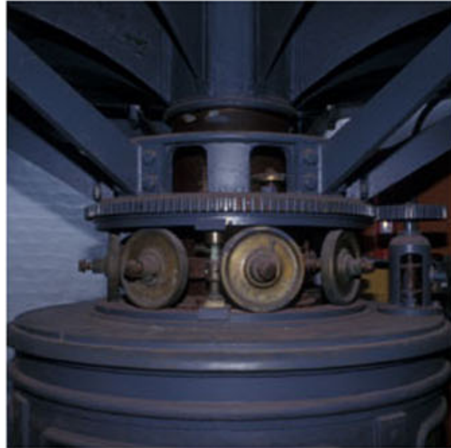
Currituck Beach Light lens chariot.

To sign up to receive electronic updates about the NHLPA program, please visit the GSA Office of Real Property Utilization and Disposal .