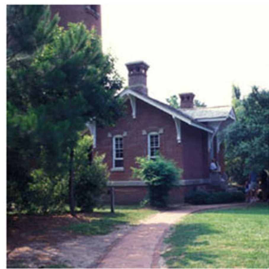
Currituck Beach Light work room.

The NPS Review Committee will evaluate the applications for completeness; past performance; ability to carry forward the goals of the NHLPA; compliance with the Secretary of the Interior's Standards for the Treatment of Historic Properties (36 CFR 68) ; and, most importantly, compliance with legal requirements of the NHLPA and the National Historic Preservation Act. The application, once accepted, becomes the principal planning document for the light station. In addition, the SHPO of the state in which the light station is located will be provided with copies of all submitted applications and asked to provide comments which will also be considered in the NPS review.