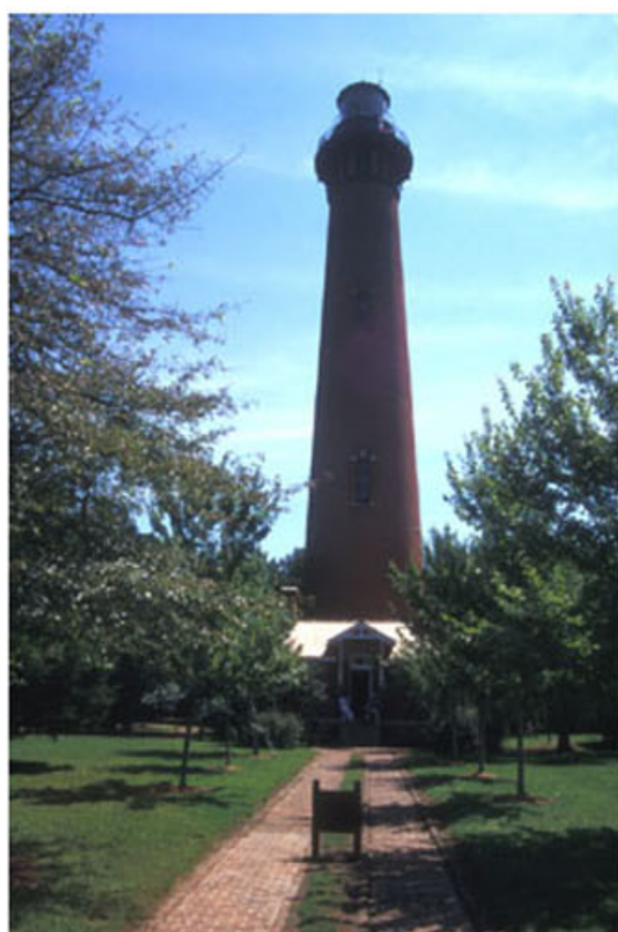
Currituck Beach Light Tower. Corolla, NC.

GSA will forward a list of qualified eligible entities from information provided in these letters to the NPS.