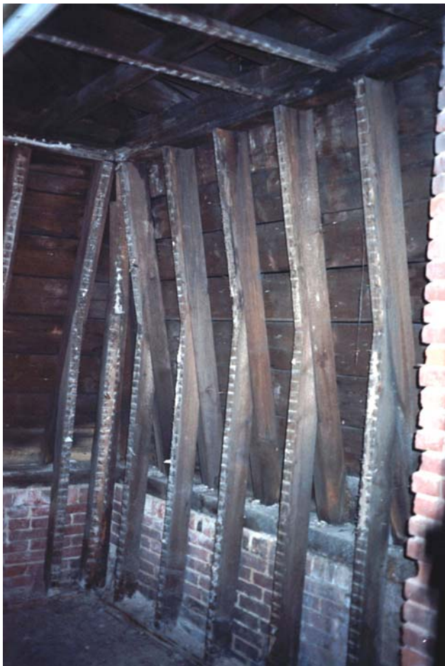
Stud walls in the interior