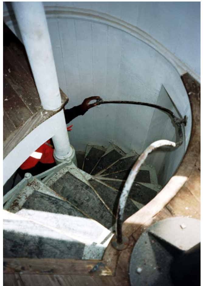
Winding staircase leading to the light